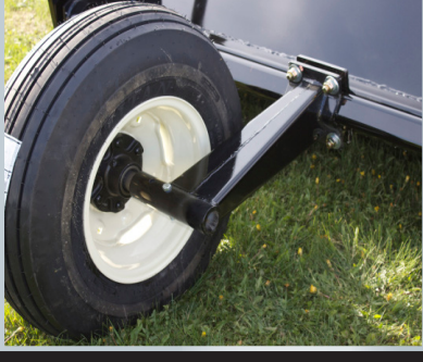
FIXED WHEEL ARM