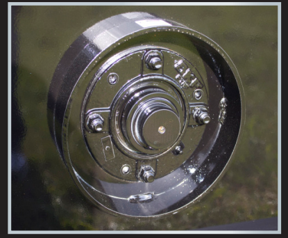
DOUBLE ROW SPHERICAL ROTOR BEARING